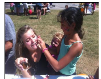
RiverStone youth reach out to Castle Lake Mobile Homes.